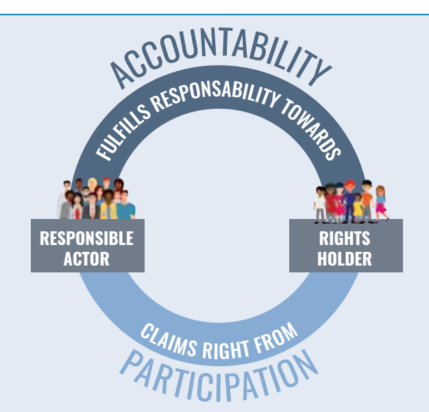
Diagrams illustrating the rights of the child-based approach<sup>12</sup>

Using this approach, SIF works in partnership with children, families, communities and States to implement comprehensive programmes to prevent and respond to violations of the rights of the child. SIF also develops programmes in partnership with other international and local stakeholders, including Non-Governmental Organisations (NGOs), to ensure a multi-sector approach.