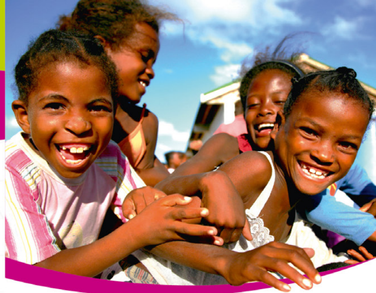
International Aid Organisation for Children in need