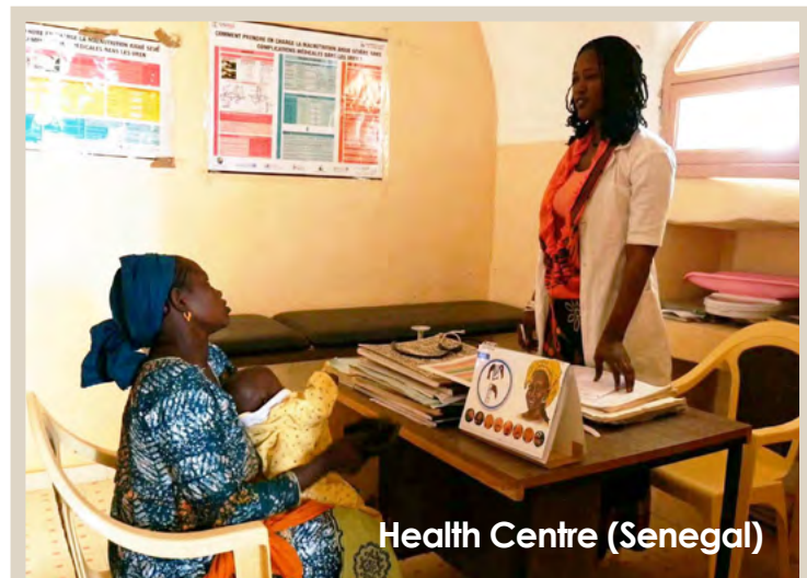
Health Centre (Senegal)